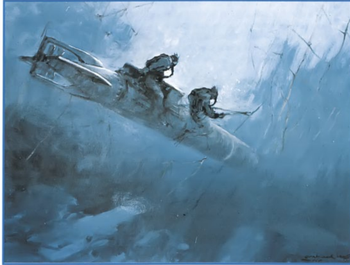
Rodolfo Claudius: assault vessel in action