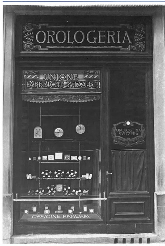
The Panerai boutique in Florence in the early 1900s.