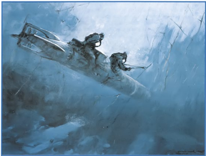
Rodolfo Claudius: assault vessel in action