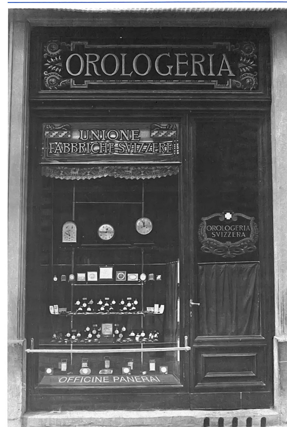
The Panerai boutique in Florence in the early 1900s.